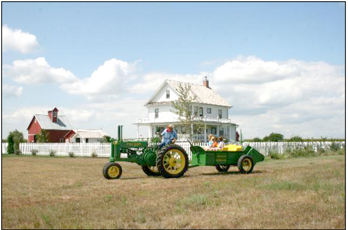
Nebraska Press Women will tour the Wessels Living History Farm near York during the Oct. 4 fall conference. The farm, an educational center, highlights farming from the 1920s to today.