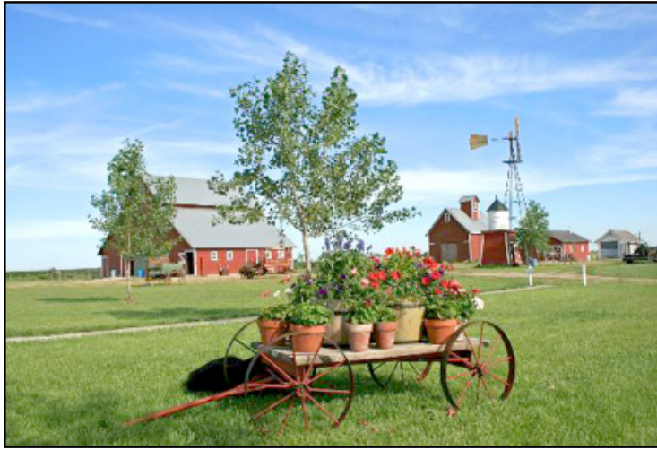
WESSELS LIVING HISTORY FARM

The farm also features a corn crib, machine shed, garage, chicken coop and a large windmill typical of the 1920s. These structures were chosen to begin the “living history farm” experience. To the south, there is a modern