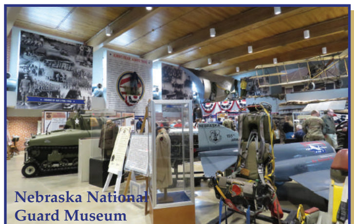
Nebraska National Guard Museum

Check out the full schedule, speaker bios, and registration and motel information in the following pages. Note that final deadlines are March 24 for reserved East Hill Motel rooms and April 17 for registrations.