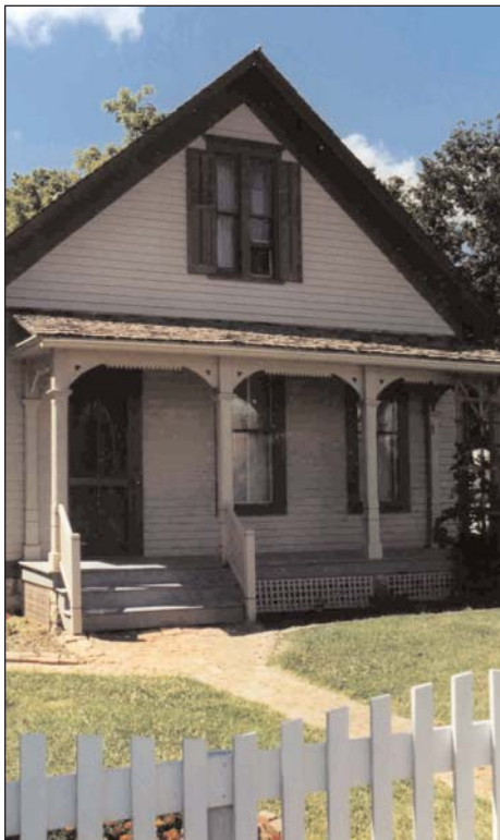
Willa Cather's childhood home.