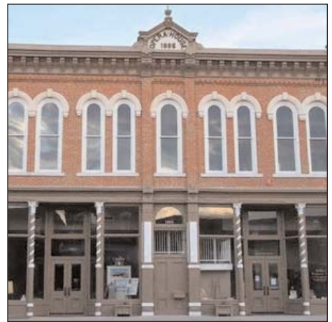
Red Cloud Opera House.

At 4:30 members will gather at The Palace Steakhouse and Lounge to help plan the NFPW 2011 convention in Omaha-Council Bluffs.