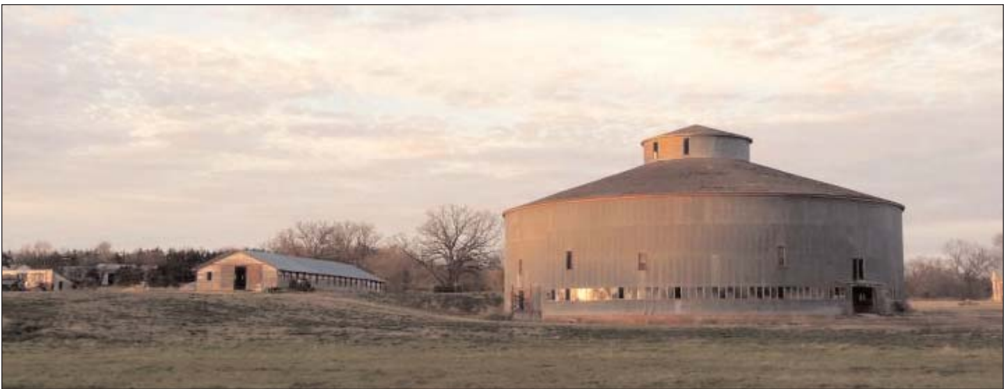
Starke Barn, Red Cloud.